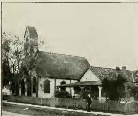
KISSIMMEE, FLA. (Church)